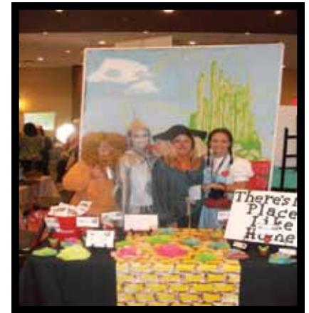
The WINNER of Best Costume was Wizard of Oz by Advanced Home Health.