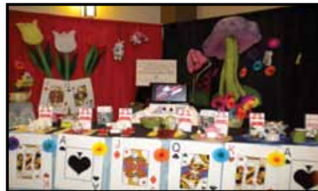
The WINNER of the Best Decorated Booth was Alice in Wonderland by Brookdale Senior Living